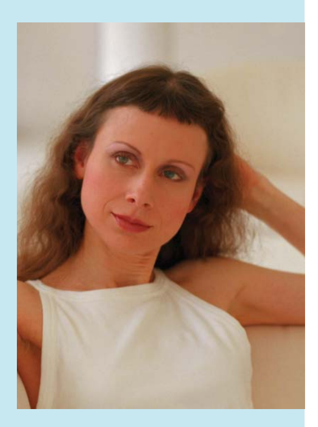
AssurityBalance Critical Illness Insurance allows you, your family, and your lifestyle to survive a critical illness and its cost.